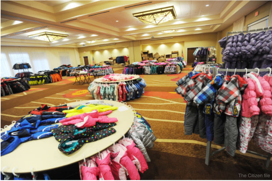
Coats await children at the Hilton Garden Inn in October for the Warm the Children coat giveaway.